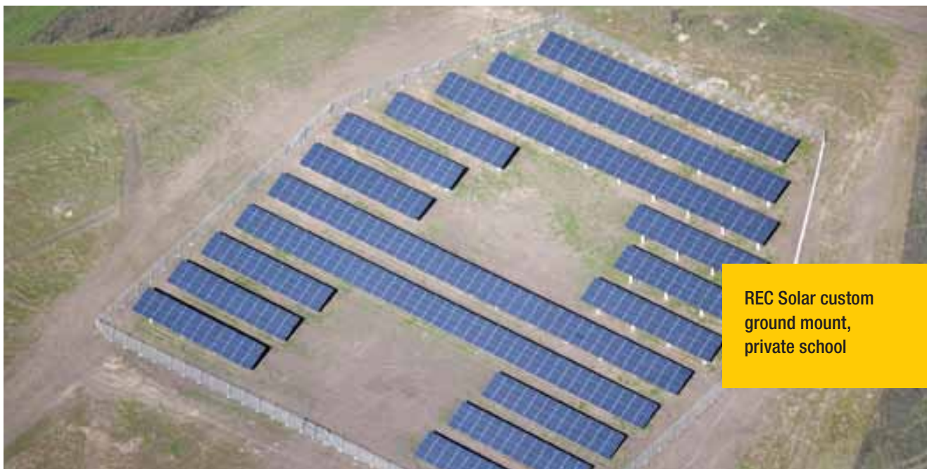
REC Solar custom ground mount, private school