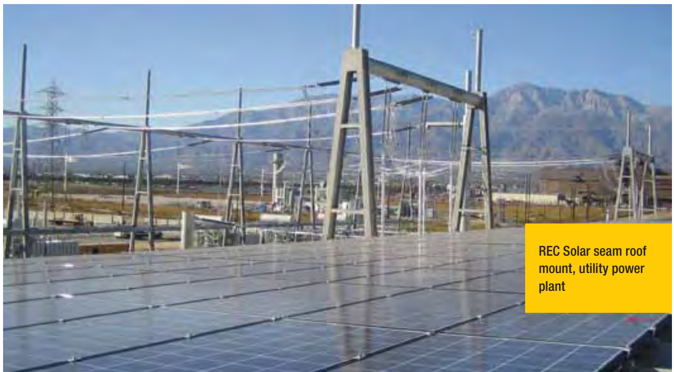
REC Solar seam roof mount, utility power plant

To initiate the process contact REC Solar: 888-657-6527 or 805-540-5486 | gsa@recsolar.com