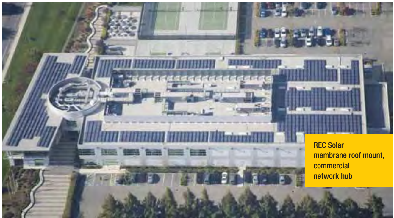
REC Solar membrane roof mount, commercial network hub

Realtime solar power production data can be monitored on a lobby kiosk display, a local-network computer, or on the internet.