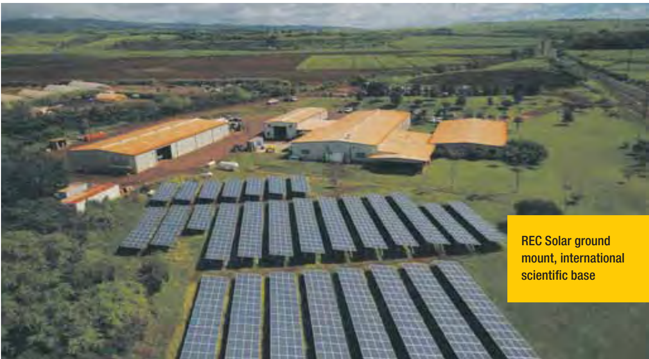
REC Solar ground mount, international scientific base

REC Solar can help bring your facility to the next level beyond energy efficiency now, enabling you to take the lead in energy policy compliance.