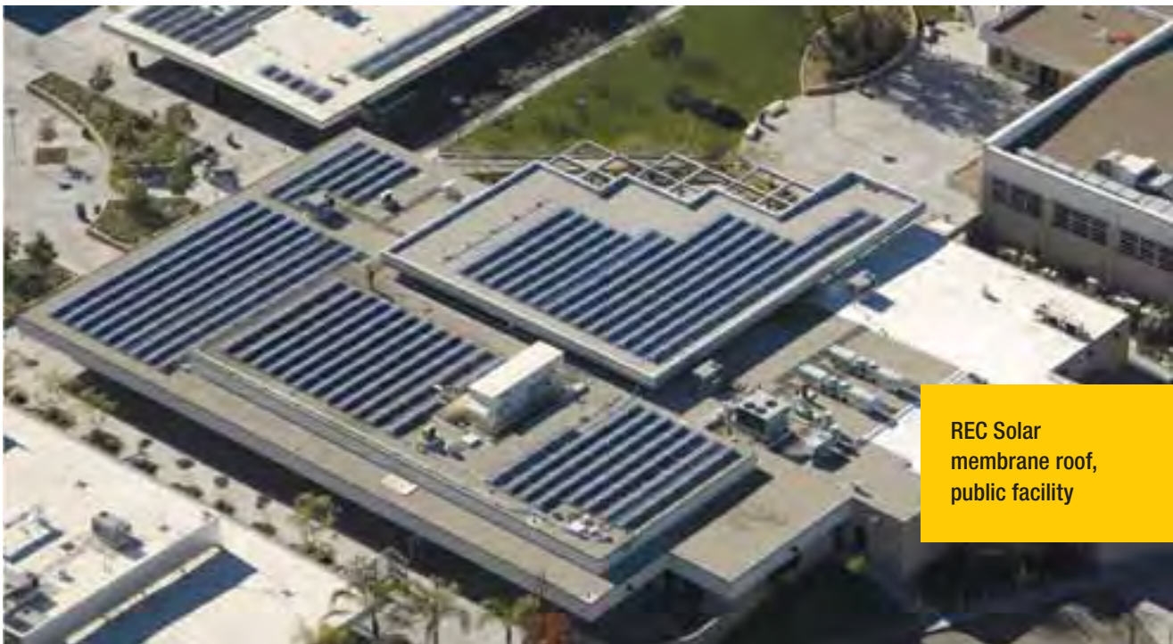
REC Solar membrane roof, public facility

The photovoltaic system can be federal agency owned, in full or in part. The system may be located on site or off site for federal customers. PV systems may be roof-mounted or ground-mounted and may be standalone or integrated into a building or a site. PV systems should integrate with the electric utility grid (grid-tied); buildings may require ancillary repair, renovations or minor alterations.